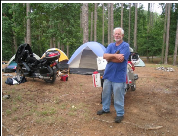
Camping was good at Town Creek despite the threatening weather.