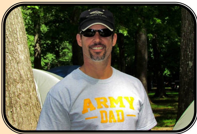
I just got out'a jail...