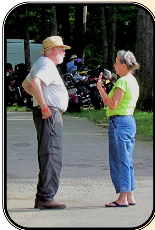
I don't care who you are, you're under arrest...