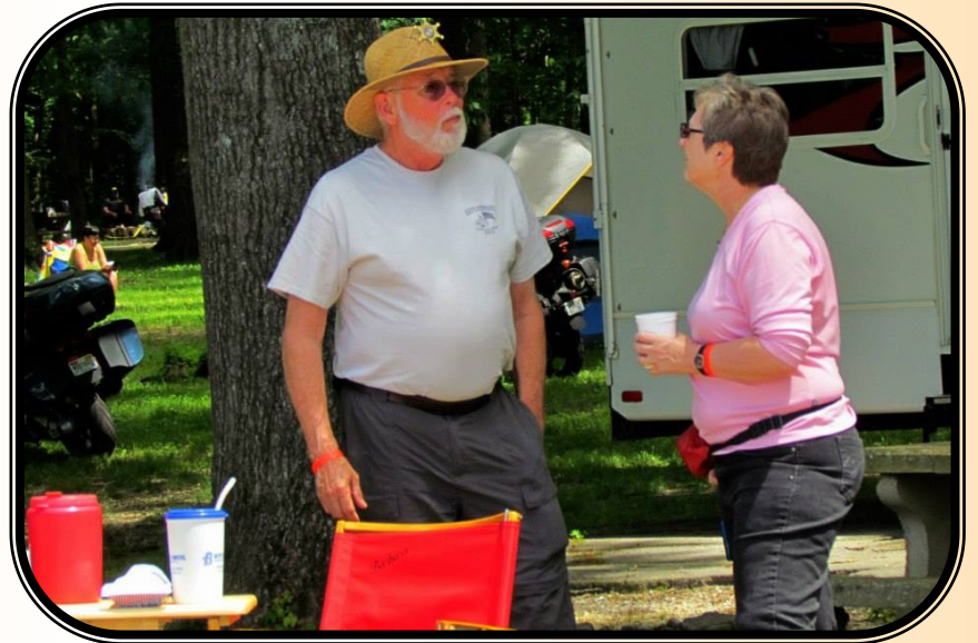
One more word and you're under arrest....