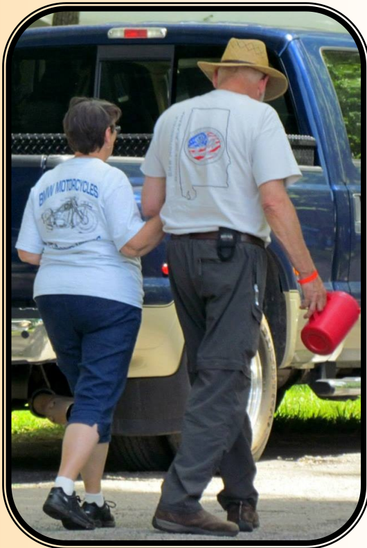
You're under arrest...

Sometime in the next few weeks our members will be sent an email blast with information about another possible rally site or information about another rally at Ditto Landing. Members voted to continue with a rally in 2014; now it is up to us to determine which direction we will go in the future. When you get that email, please read it and respond as quickly as possible with your vote. If we truly want to continue our rally, we must decide how to go about it, and do it quickly.