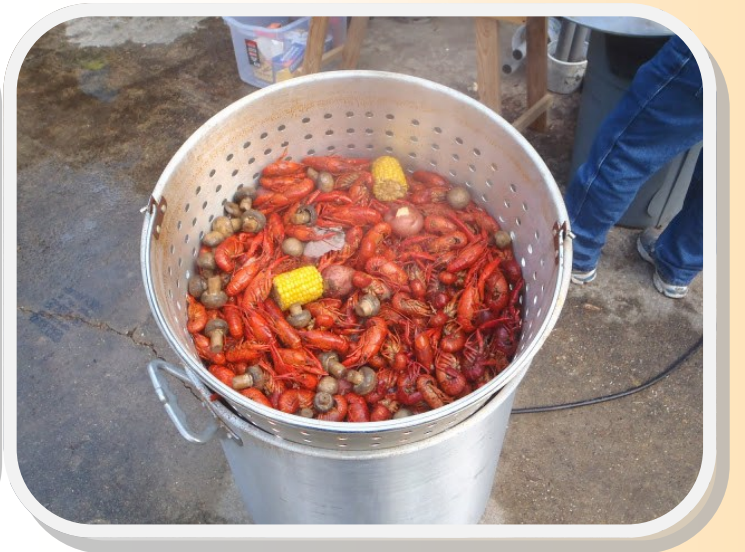
This is what a Crawfish Boil is all about!