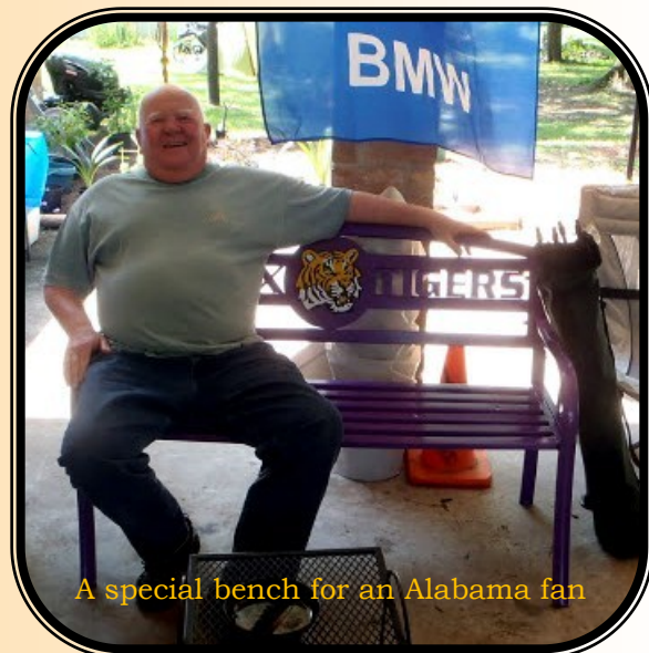
A special bench for an Alabama fan

Saturday started out with really good breakfast at Amelia’s, followed by an afternoon of snacks and beverages while anticipating dinner; and dinner it was with 400 pounds of crawfish boiled with potatoes, corn, mushrooms, onions, and of course whole garlic pods (they taste like butter when cooked that way). Yes, I did say 400 pounds!